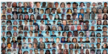
ICHSM 2022 Virtual Conference