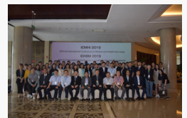
ICHSM 2019 Xiamen, China