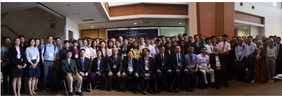
ICHSM 2018 Tsukuba, Japan