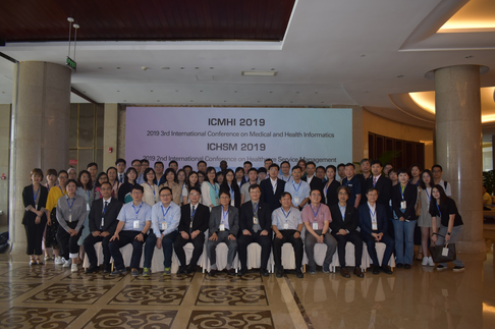
ICHSM 2019 Xiamen, China