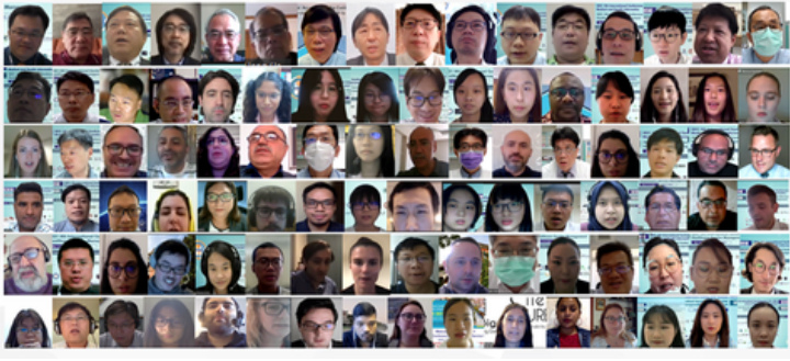
ICHSM 2021 Virtual Conference