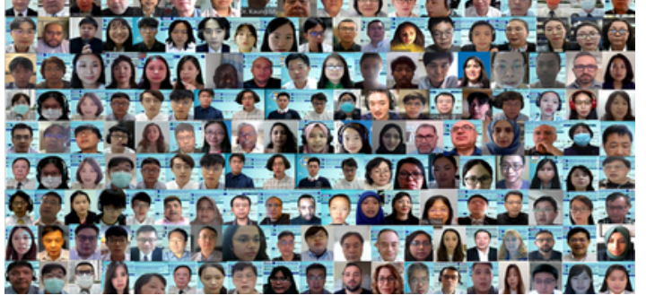
ICHSM 2022 Virtual Conference