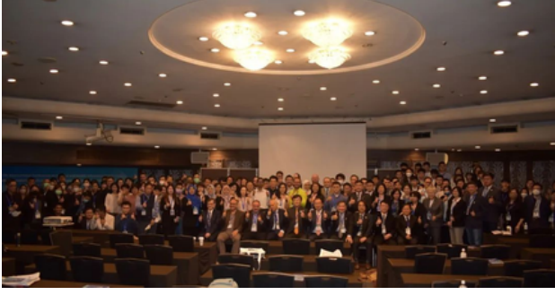
ICHSM 2023 Kyoto, Japan