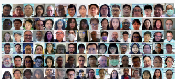
ICHSM 2021 Virtual Conference