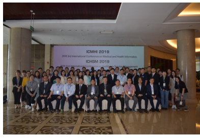
ICHSM 2019 Xiamen, China