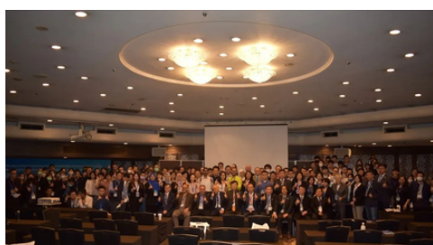
ICHSM 2023 Kyoto, Japan