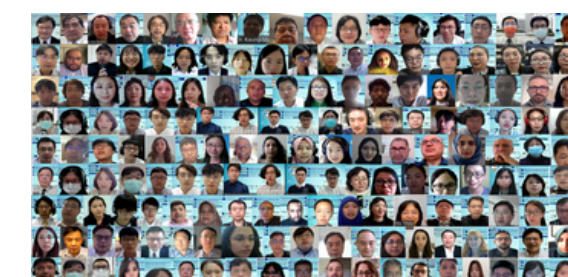
ICHSM 2022 Virtual Conference