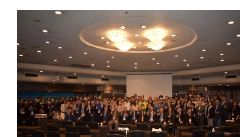
ICHSM 2023 Kyoto, Japan