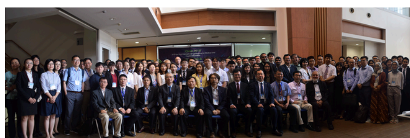
ICHSM 2018 Tsukuba, Japan