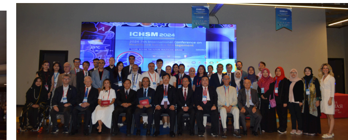
ICHSM 2024 İstanbul, Turkey