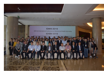
ICHSM 2019 Xiamen, China